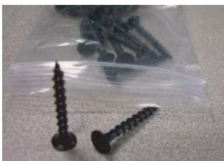
Screws for attaching your wood (1" x 3") to the rails