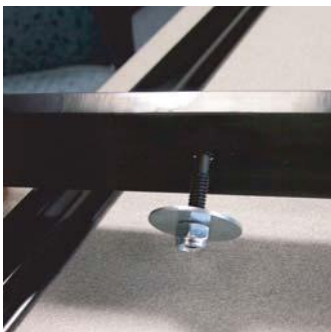
Nylon Lock Nut, Washer & T-Bolt (used with corner tracks)

STEP #5 Screw 24" long pieces of 1"x4" wood into the rails. Use 5 screws per rail for proper support Positioned as shown below.